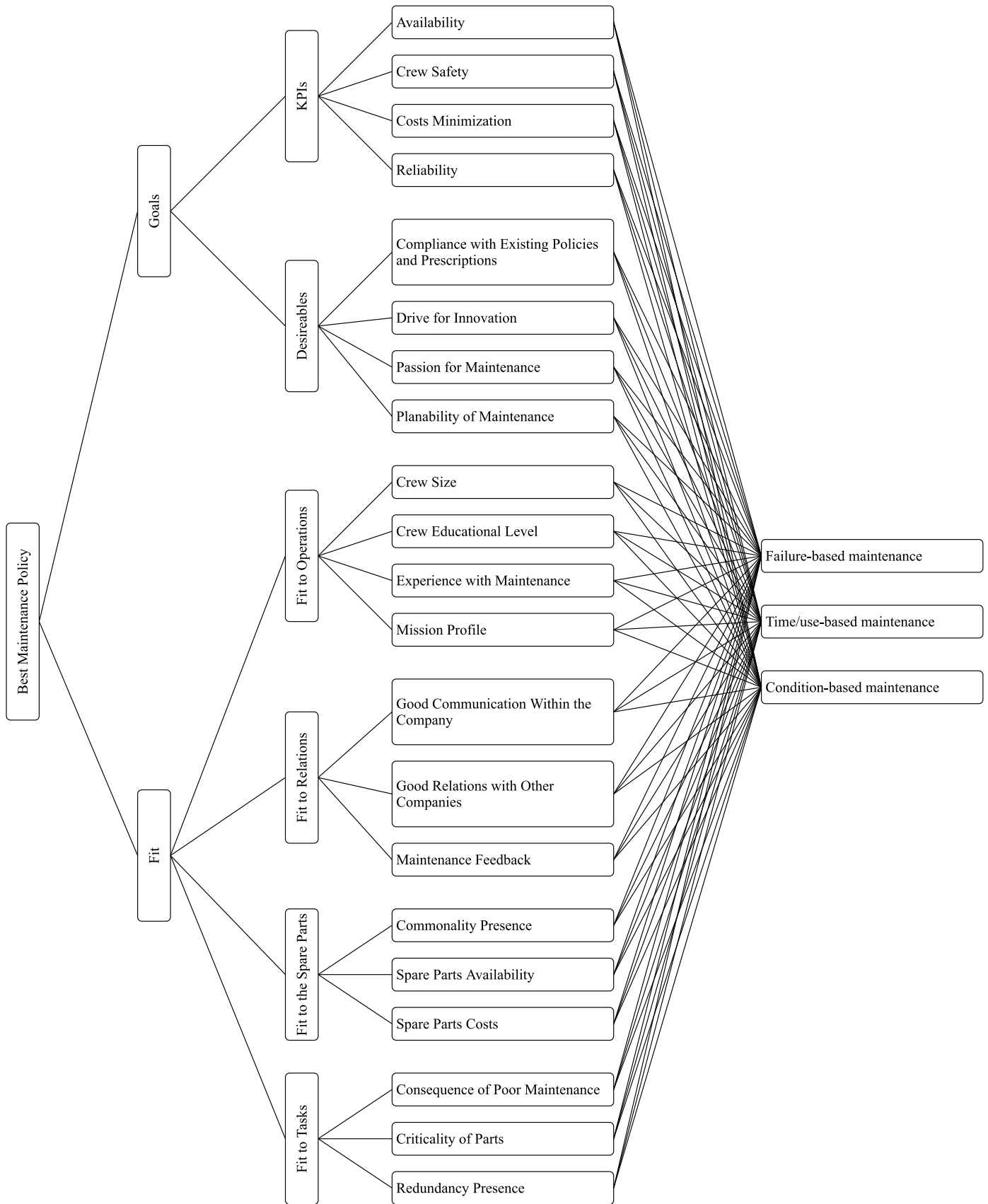
Figure 1: The hierarchy of criteria